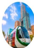
Tour by LRT