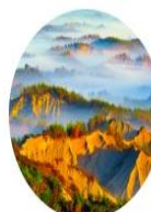
Landscape and Ecology Tour