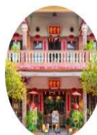
Experience slow food travel