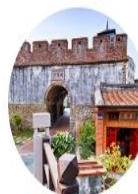
Fongshan Ancient Military City