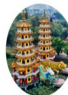
Zuoying Historical Tour